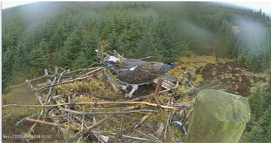
a recalcitrant stick