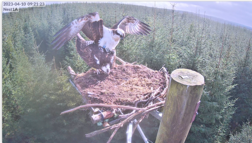
one of a number of successful copulations

wing. She is being visited by three males - one the unringed male who has been around Nest 1A for a week or so, one a male with a right leg BTO ring only, but most often by W6 from Nest 6.