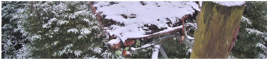
snowy in Kielder Forest