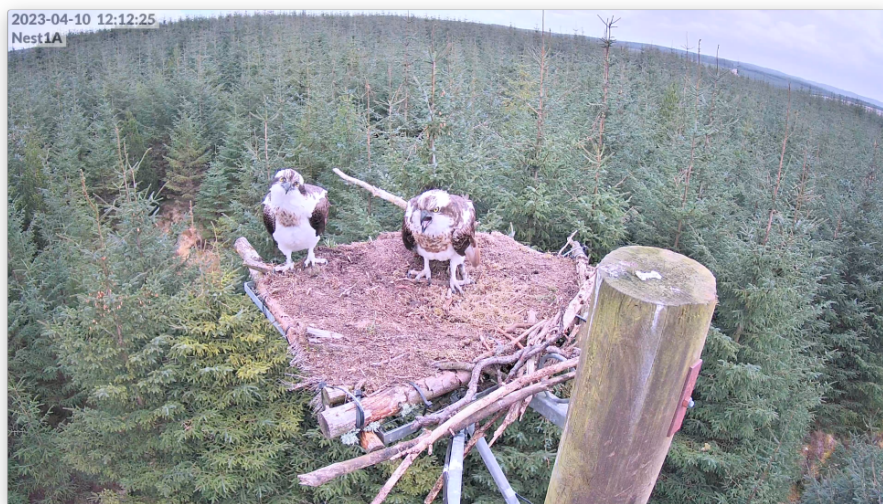
the BTO ringed male turns a deaf ear

As you can see, they are getting on quite well! The other two males are more reluctant than W6 to supply her with fish.