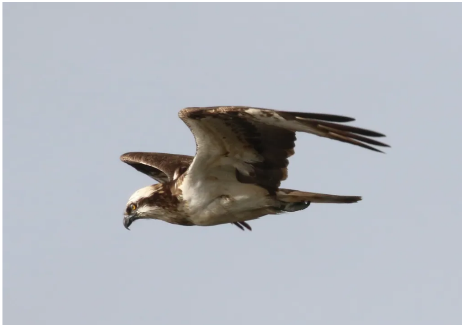
UV on the lookout for a meal