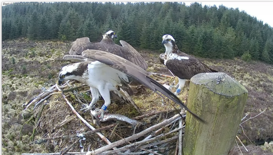
PT9 touches down

This is the only nest where life is jogging along as normal! 69 and Mrs 69 are eating well, copulating and generally having a quiet life. There is an occasional intruder to spoil their peace.