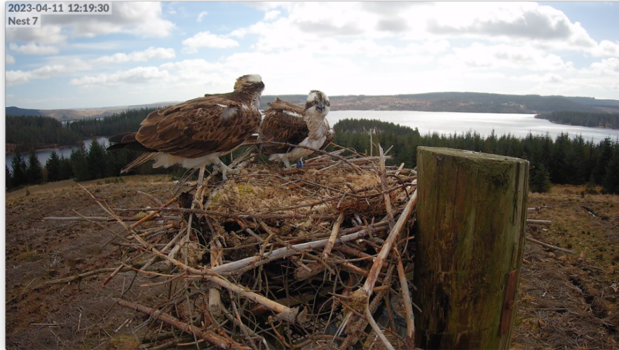
JW6 solicits beside KX7

We hope Samson returns very soon to keep JW6 under control!