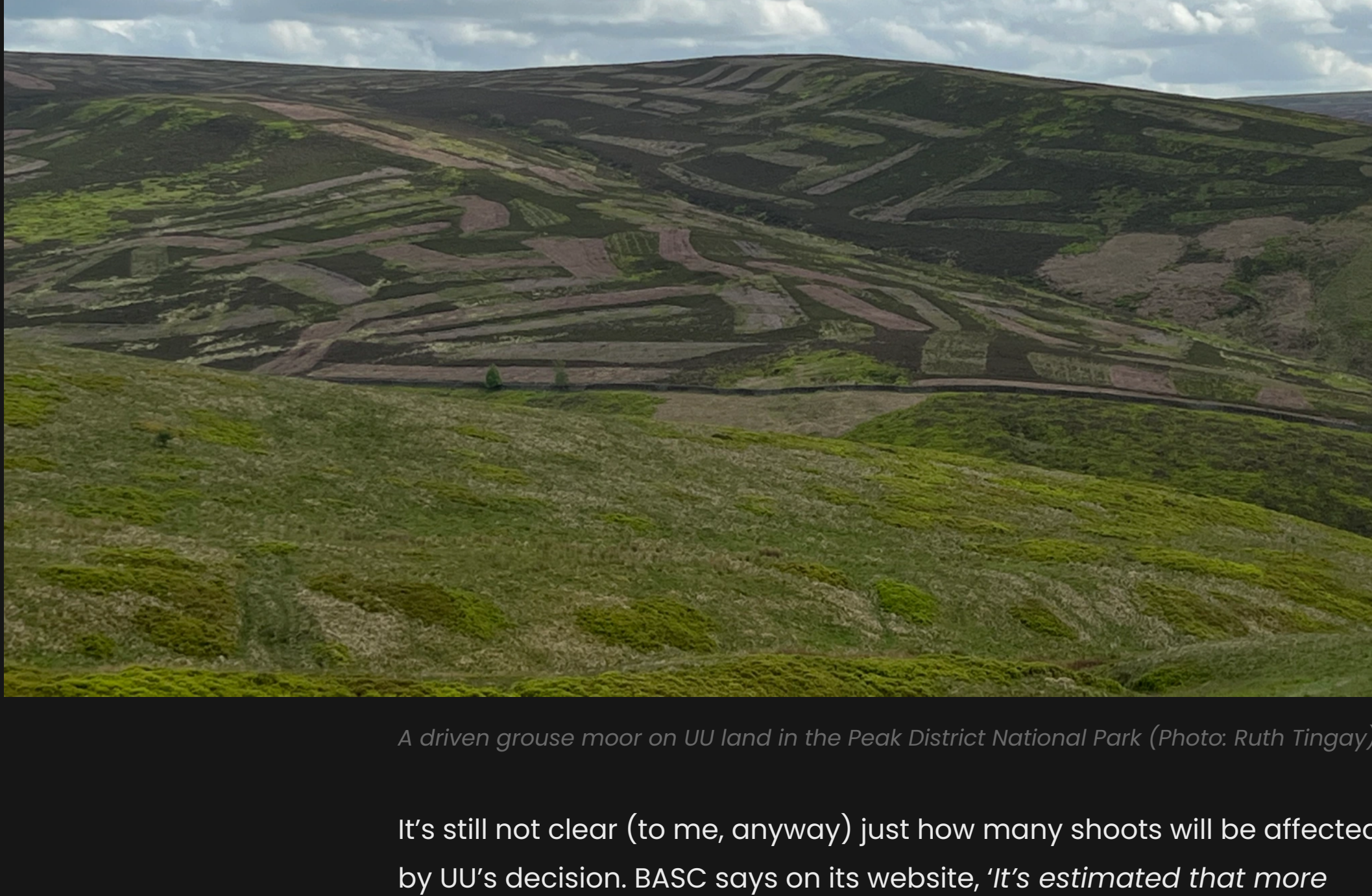
A driven grouse moor on UU land in the Peak District National Park

It's still not clear (to me, anyway) just how many shoots will be affected by UU's decision. BASC says on its website, 'It's estimated that more than 30 shoots will be shut down as a result' whereas the Countryside Alliance says on its website that UU's decision "...will close seven grouse moors and three low ground shoots'.