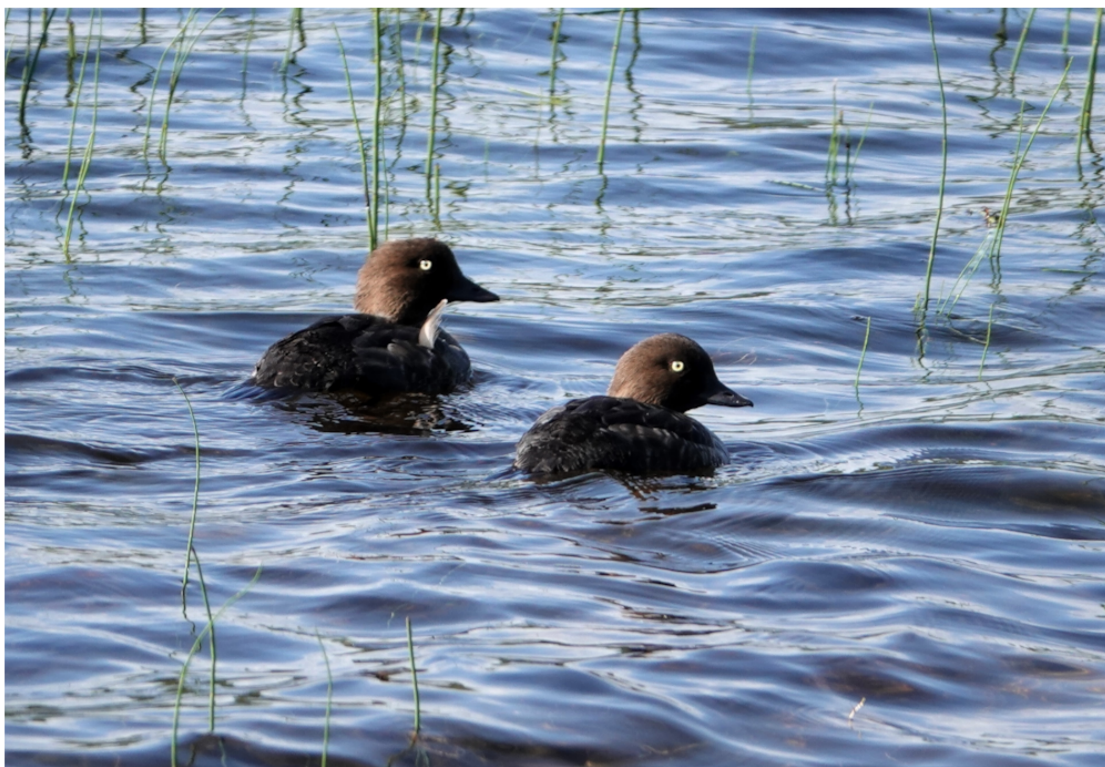
Common Goldeneye enjoyed a successful breeding season at Muir of Dunnet.

The news follows measures taken at the reserve since 2021 to reduce disturbance from recreational activity on the reserve's Loch Kinord, where visitors are asked to stay off the water during the breeding season.