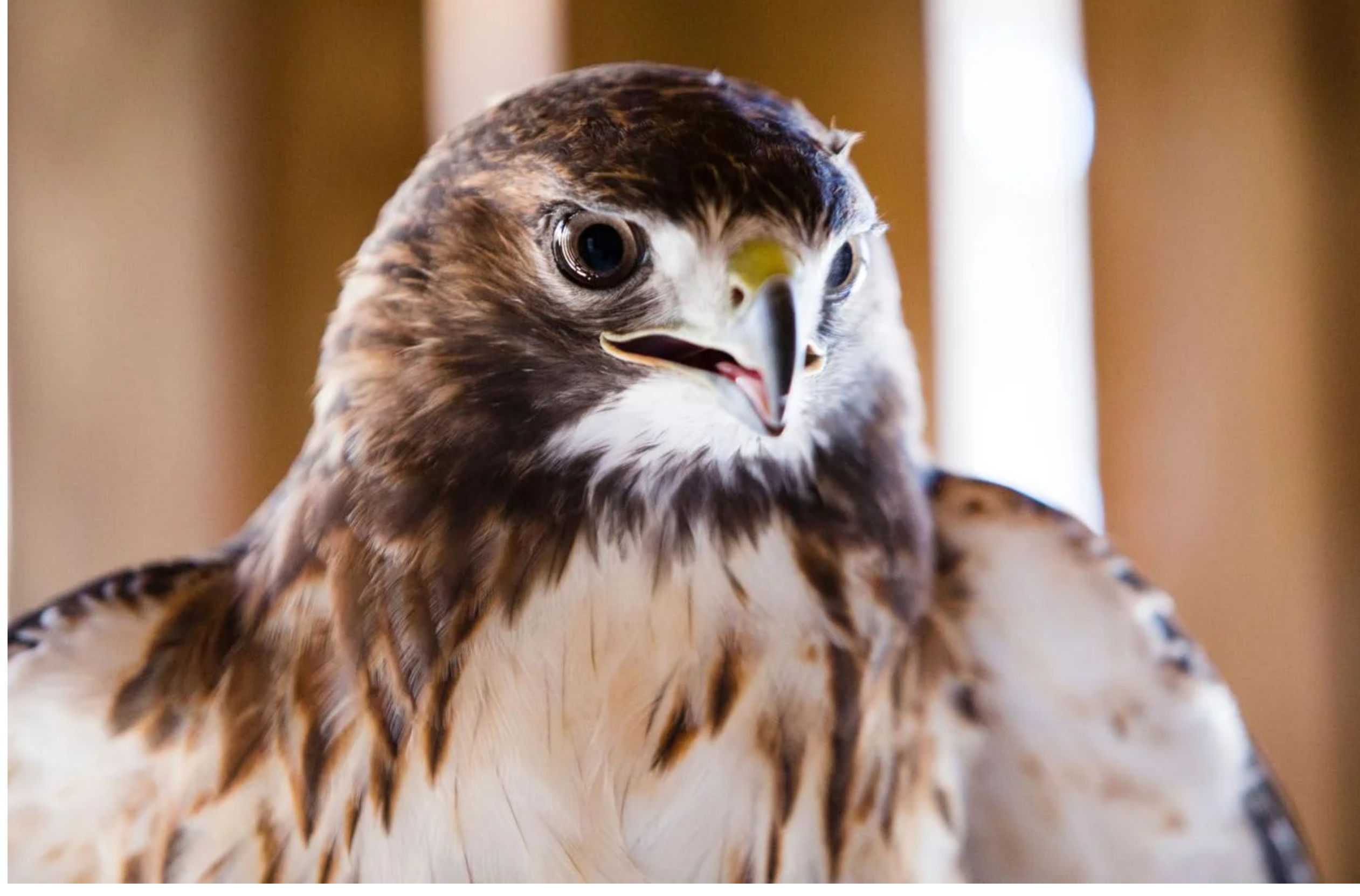
The findings show the ongoing, widespread exposure of birds of prey (such as red-tailed hawks, pictured) in the northeastern United States to anticoagulant rodenticides, underscoring the need for reevaluation of mitigation measures intended to decrease this risk.

Research from Tufts Wildlife Clinic at Cummings School of Veterinary Medicine shows that, in addition to anticoagulant rodenticides, another type of rodent poison can bioaccumulate in hawks and owls