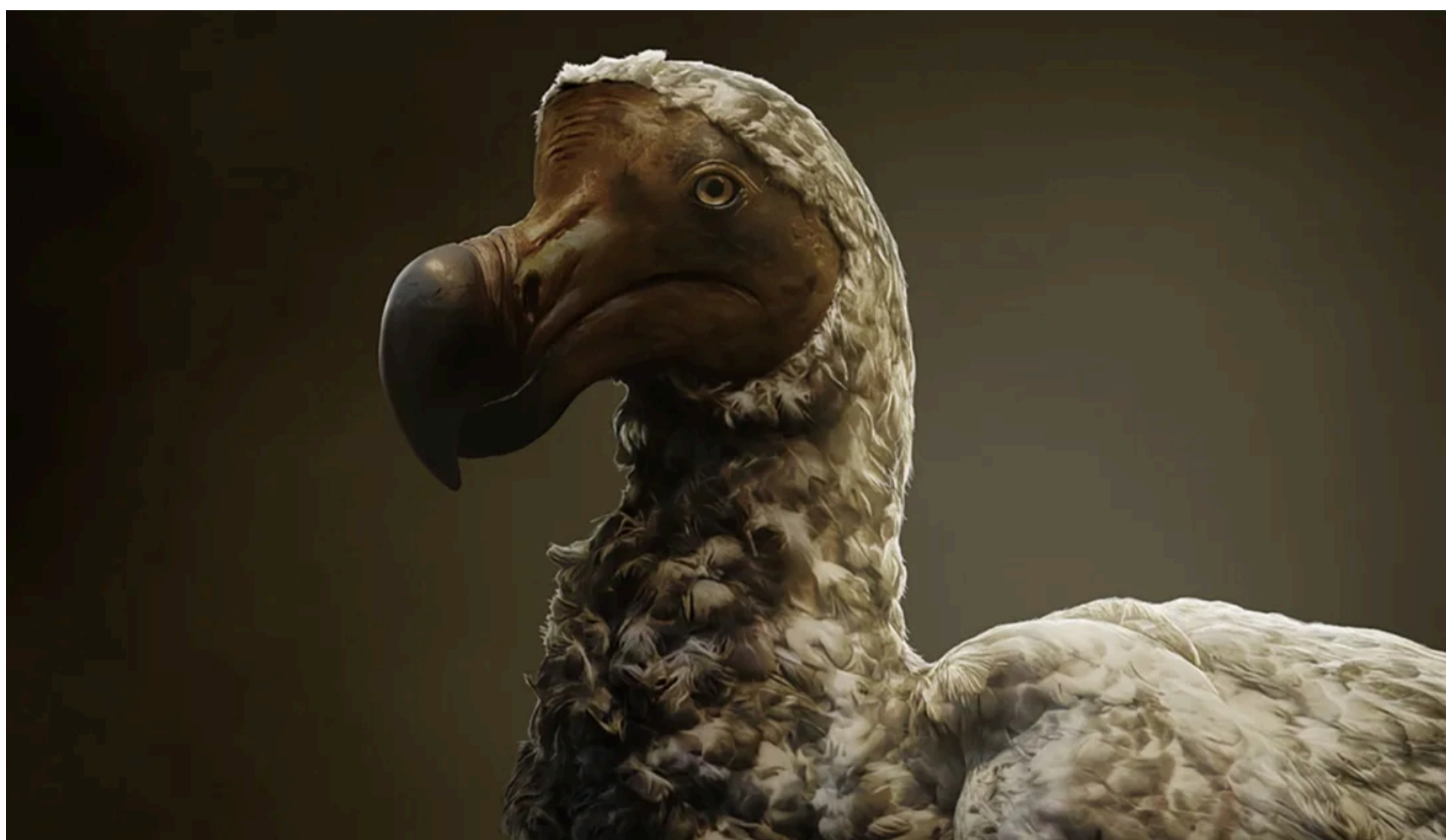
An illustration of a Dodo.

The company has entered a partnership with the Mauritian Wildlife Foundation to find a suitable location for the large flightless birds, with the belief that its return to Mauritius could also benefit Dodo's immediate environment and other species.