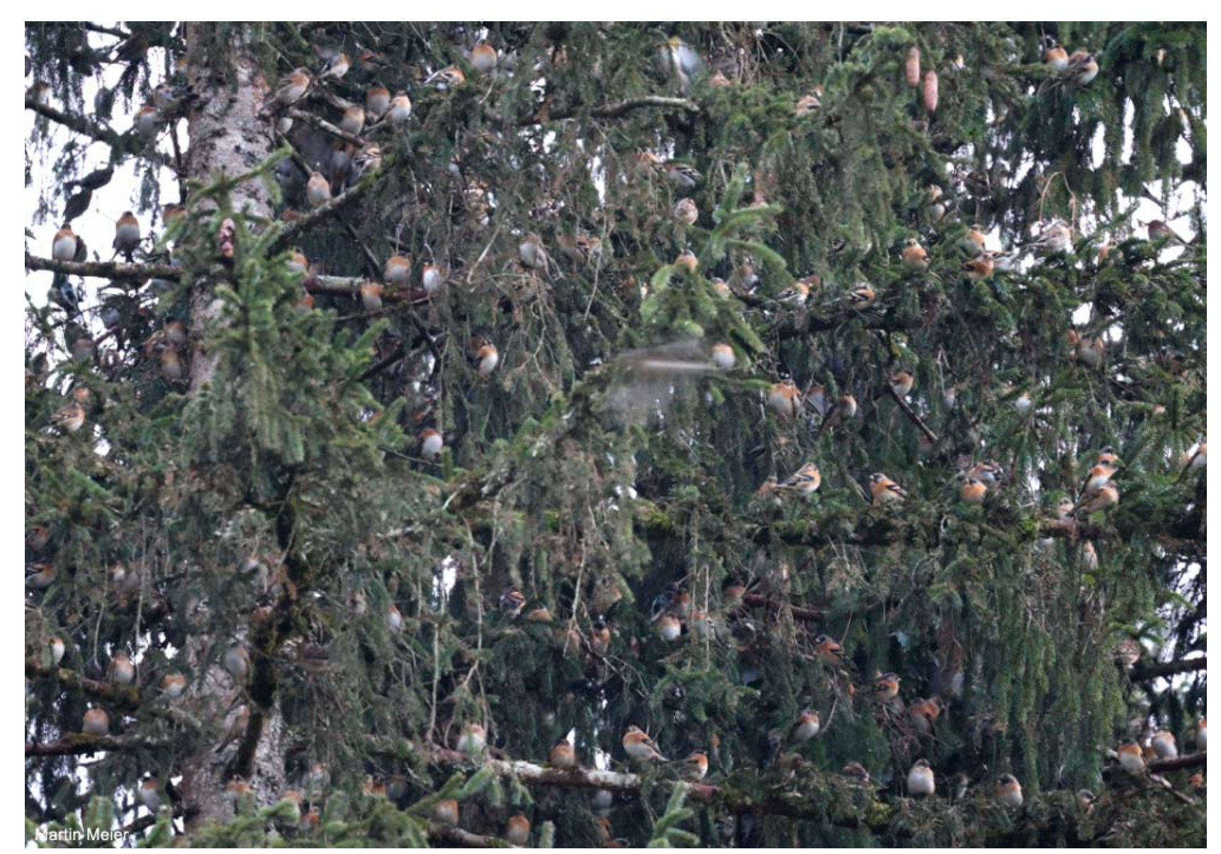
The large gathering of finches has attracted predators (Martin Meier)

One recent mega-flock event consisted of roughly 5 million birds in the Zasavje Hills of central Slovenia during the winter of 2018-19, which frequented an area of only 10 ha.