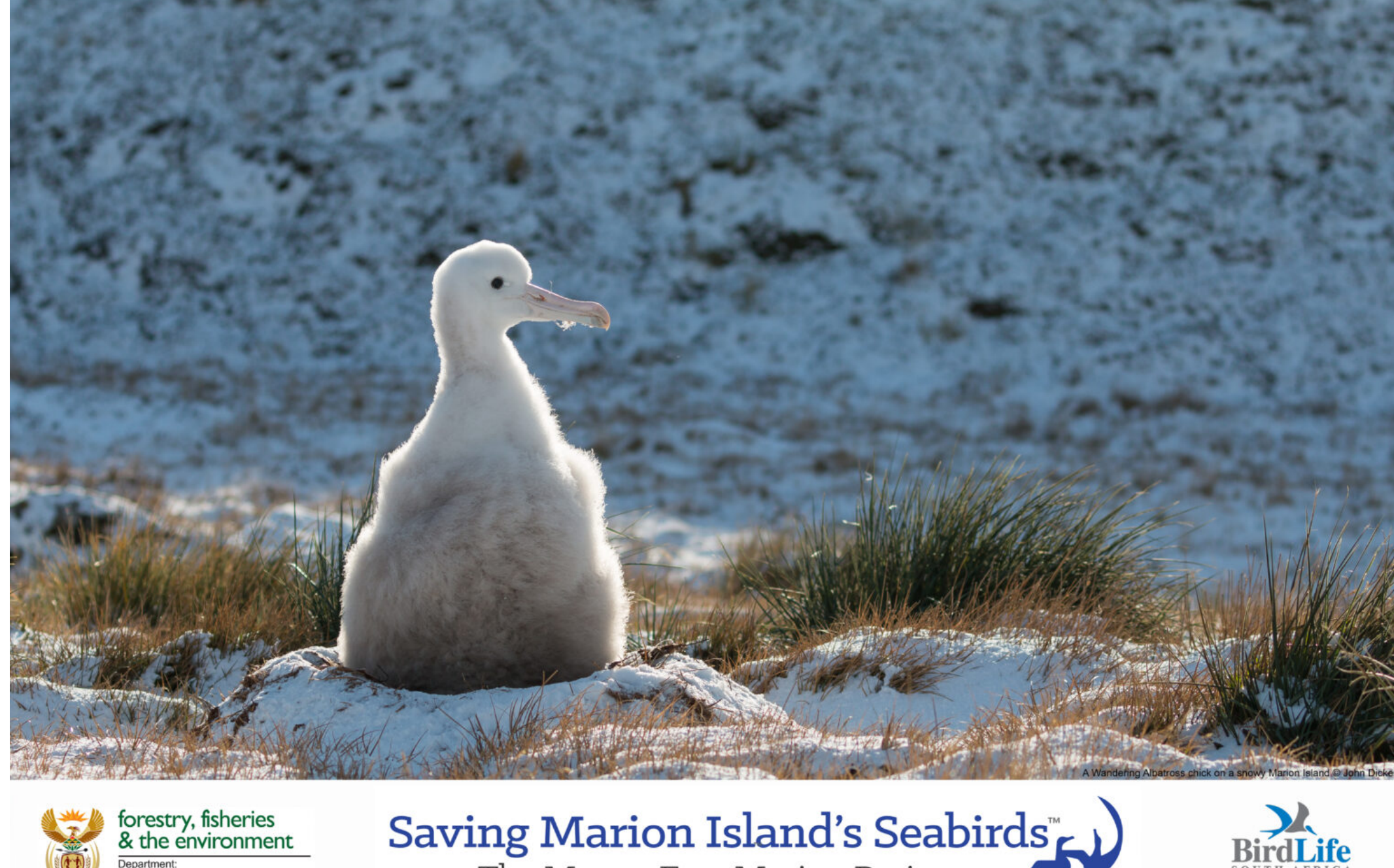
A Wandering Albatross chick on Marion Island

The Mouse-Free Marion Project is a registered non-profit company (No. 2020/922433/08) in South Africa, established to eradicate the invasive albatross-killing mice on Marion Island in the Southern Ocean. The project was initiated by BirdLife South Africa and the South African Department of Forestry, Fisheries and the Environment . Upon successful completion, the project will restore the critical breeding habitat of over two million seabirds, many globally threatened, and improve the island's resilience to a warming climate. For more information or to support the project please visit mousefreemarion.org .