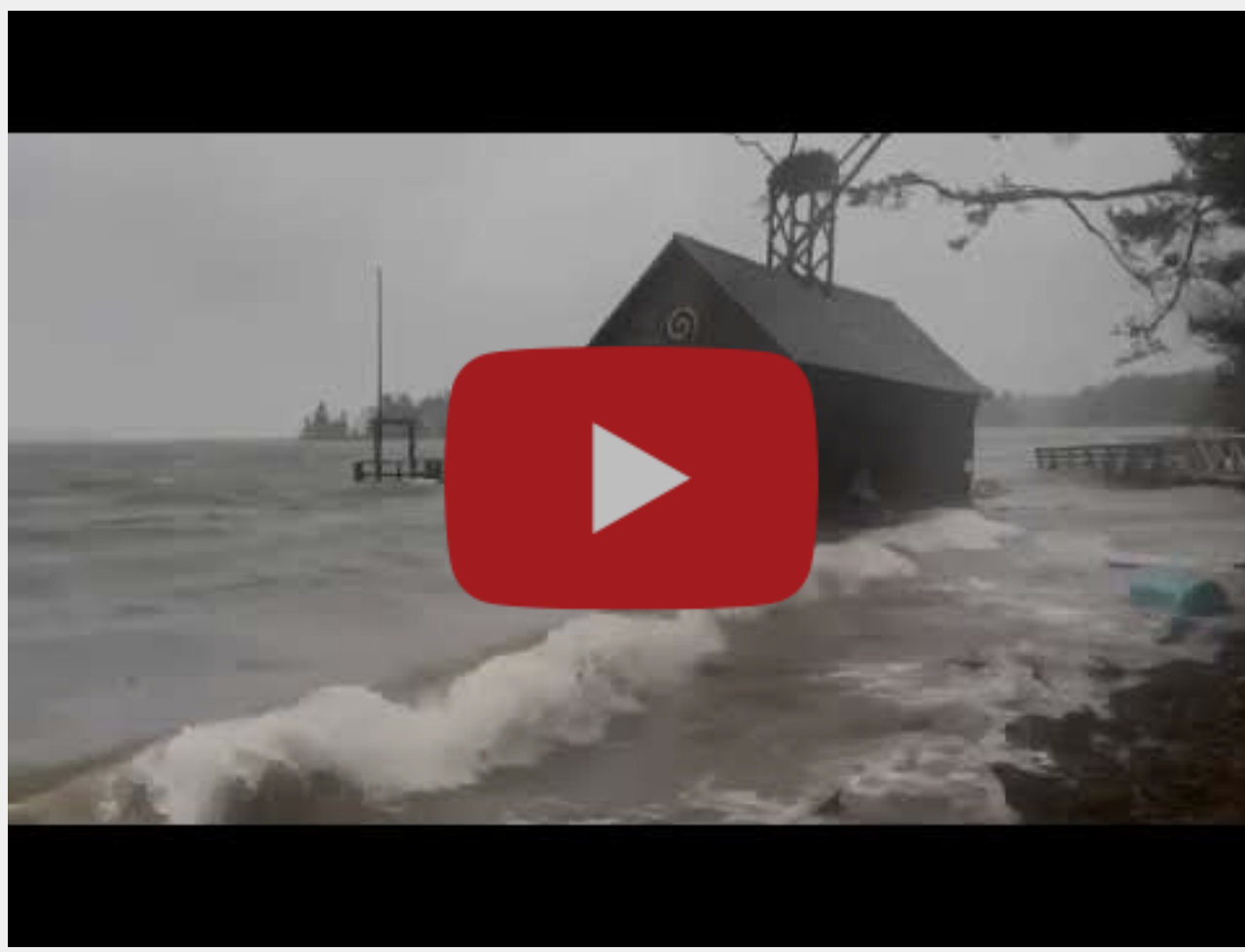
Check out the post-storm video footage from the mainland