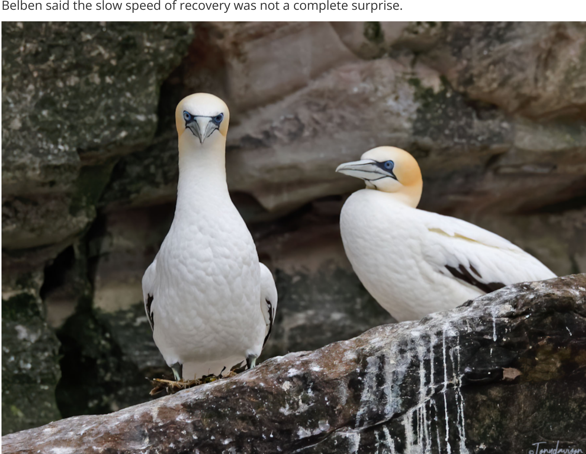
Alderney's Northern Gannet population has been decimated by bird flu.