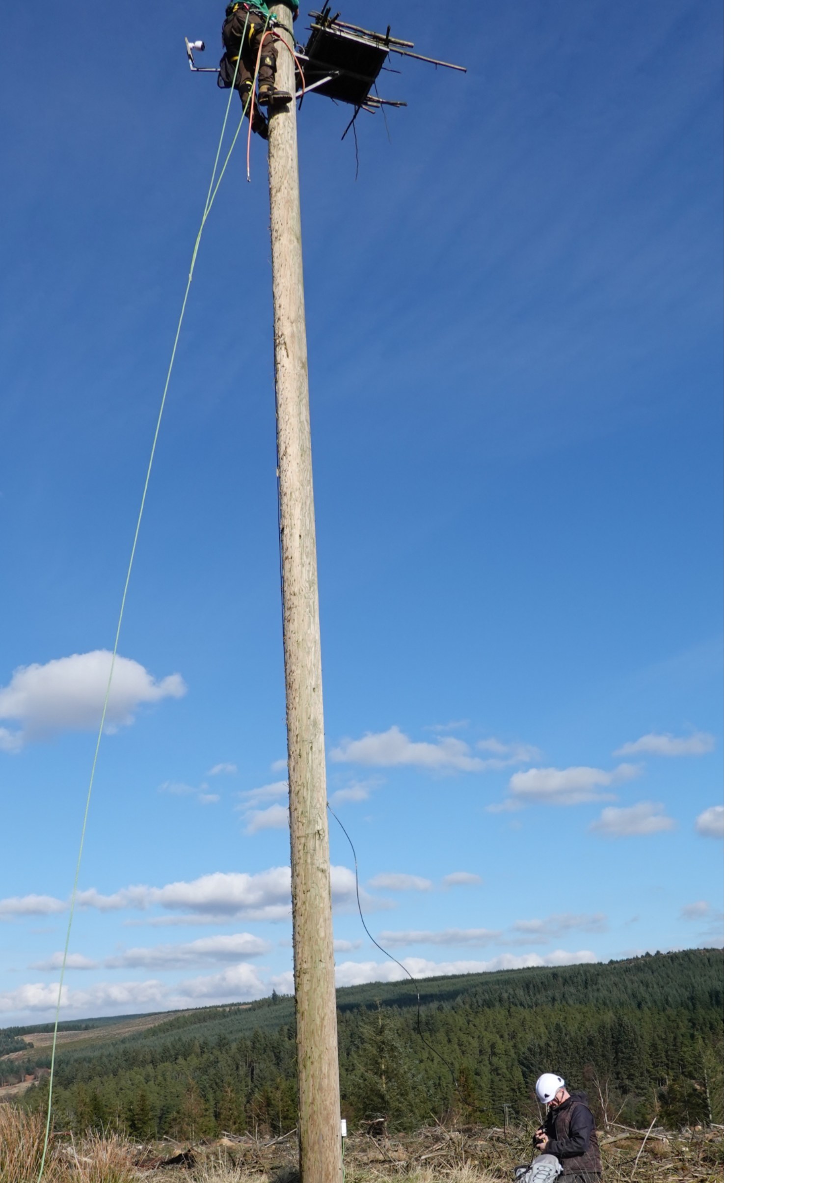
Peter powering up his laptop

Peter from Outersight , who maintain the technical infrastructure, checked the cameras were working and well positioned at the bottom of the poles.