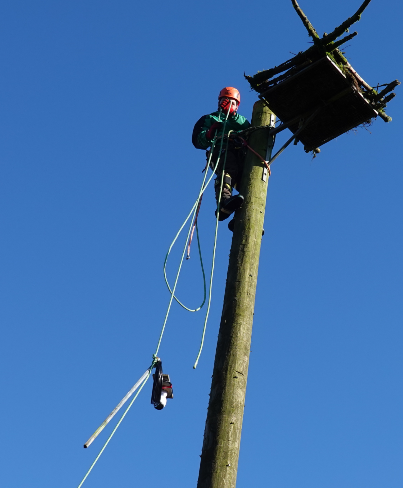
Iain raises the new camera for Nest 4

Cameras were put back on several nests in Kielder Forest last week, in readiness for the return of the resident ospreys. Forestry England Rangers Iain and David climbed in wall to wall sunshine – at least early in the day!