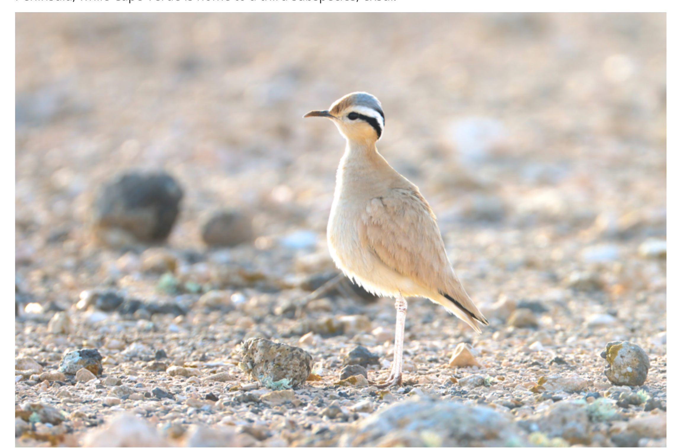
Aridification is thought to have been a driving factor in the northernmost Cream-coloured Courser breeding record, with four young found in western Türkiye.

The edge of the desert wader's range is south-eastern Türkiye, where the form bogolubovi extends east to India. The nominate form is found in arid landscapes on the Canary Islands, across North Africa and Arabian Peninsula, while Cape Verde is home to a third subspecies, exsul.