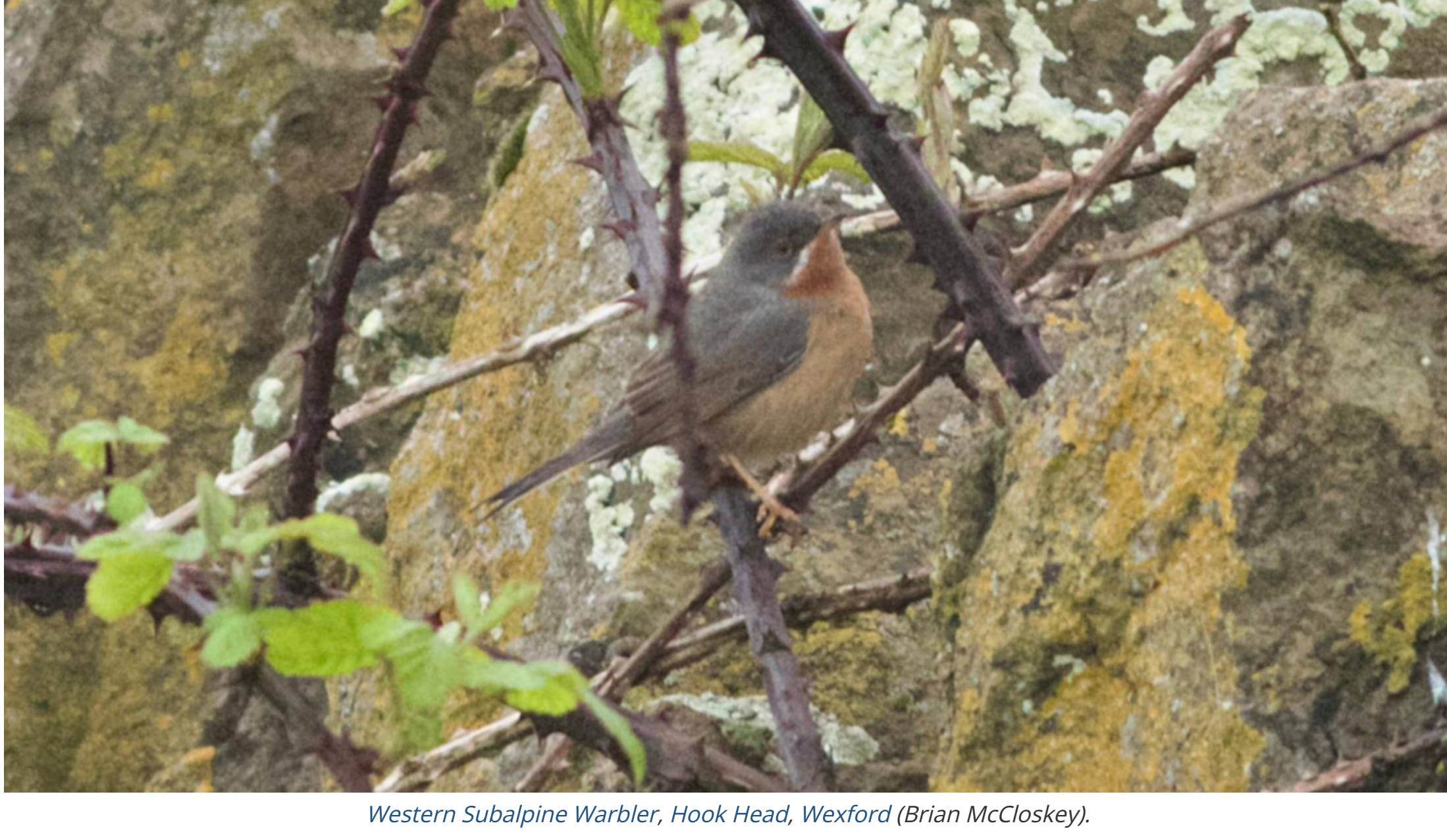
Western Subalpine Warbler, Hook Head, Wexford (Brian McCloskey).

Portland and Dorset's first Western Subalpine Warbler since 2016 was one of the week's rarity highlights, when a male was found on the island on 14th. A rare twitchable Irish Western Subalpine Warbler resided at Hook Head, Co Wexford, from 11th, where it shared the stage with a Woodchat Shrike . A small arrival of the latter species saw five found in Britain. Most notably, a one-day bird at Beddington Farmlands on 12th was supremely popular with both Surrey and London listers, while another at Tanybwch, Ceredigion, was also noteworthy.