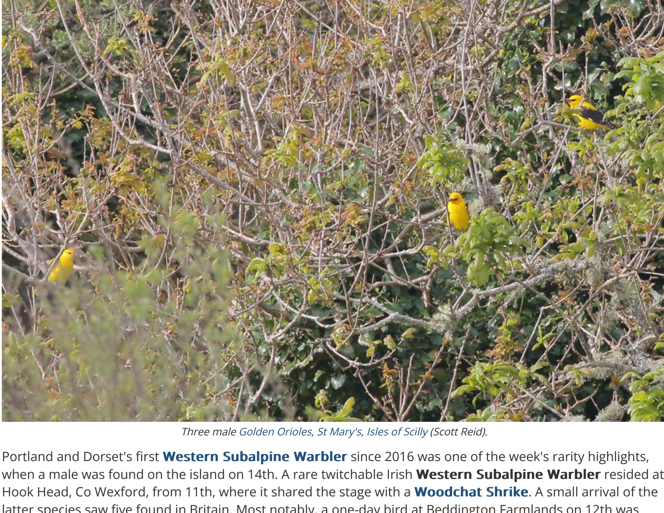
Three male Golden Orioles, St Mary's, Isles of Scilly (Scott Reid).

Just what led to such a bumper fall is somewhat of a mystery, though it seems likely that record-breaking temperatures across southern Europe may have contributed. A high-pressure system embedded over mainland Europe brought extraordinary early heat to France and Iberia, with temperatures reaching a sweltering 33.5°C in Castilla y León. Birds haven't even arrived en-masse back in Iberia yet - perhaps some were encouraged to continue straight over? Whatever the case, it may mark the start of fourth spring in a row which proves fruitful for this species.