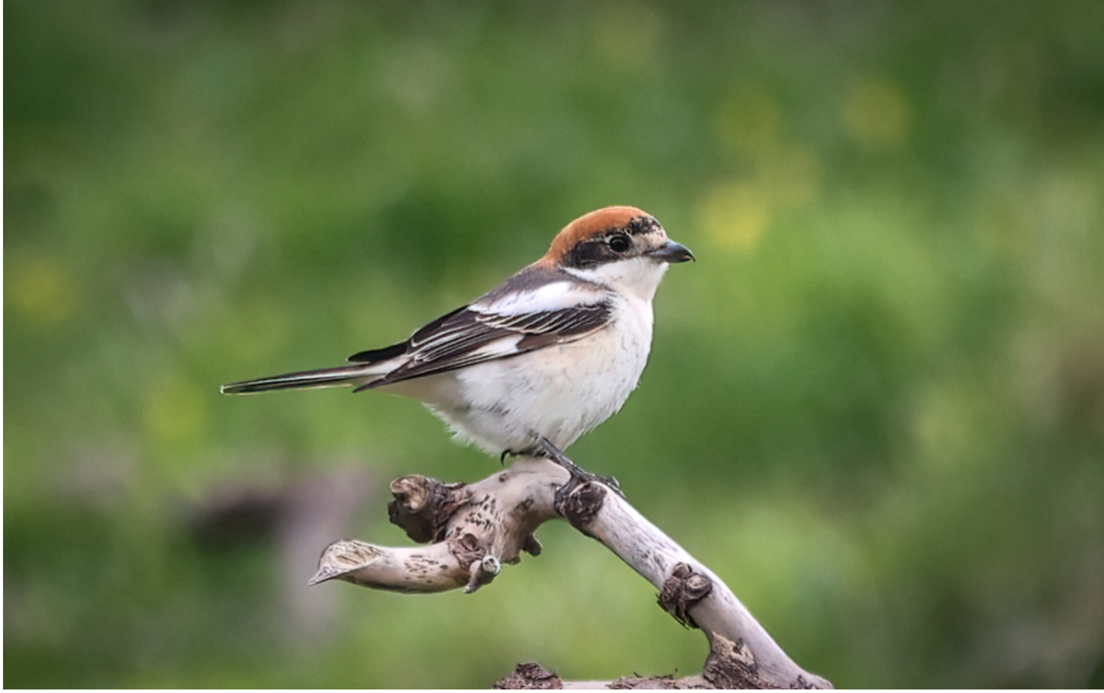
Woodchat Shrike, Tanybwch, Ceredigion.

Birders in central and southern England were graced by a widespread Whinchat arrival that kicked off in style from 9th. These bundles of orange joy are undoubtedly one of the most eagerly awaited species during spring passage in lowland areas - alongside Pied Flycatcher , Common Redstart and Ring Ouzel . Cambridgeshire boasted the first returning European Turtle Dove on 12th.