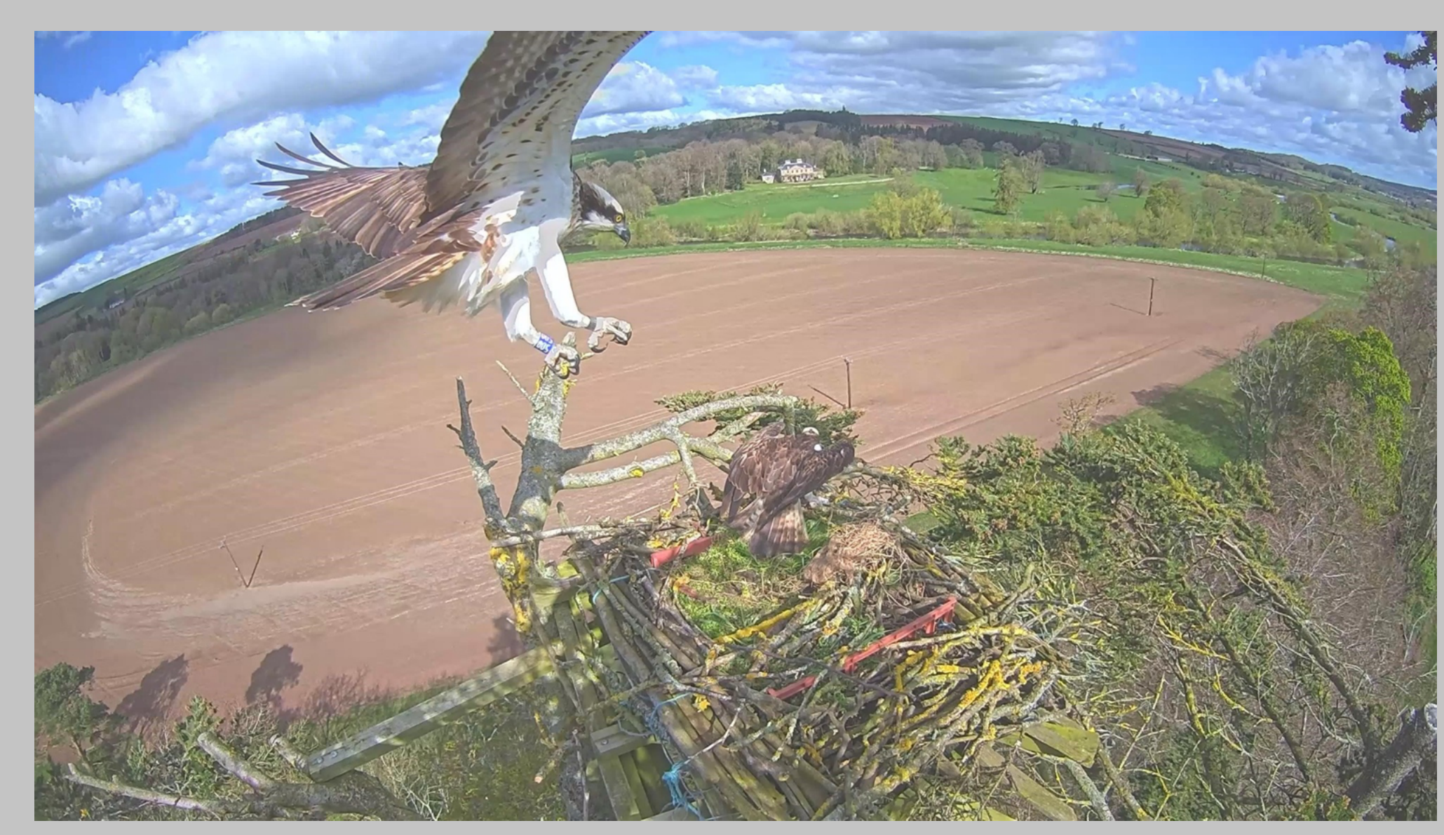
Blue 500 touching down

For those of you who follow several osprey nests, you will know of Joanna Dailey from Kielder, who is an encyclopaedia of osprey knowledge and is brilliant at keeping track of all the Kielder nests and who is mating with whom there and who is intruding, how many eggs each nest has and when chicks are due to arrive etc etc. (I struggle with just the one and she has 10 to monitor!). However, to add to her many talents, we must now add Osprey Whisperer. An unattached 4 year old female osprey, hatched south of Inverness and ringed Blue 500, has been causing all sorts of trouble at Kielder, intruding at various nests and causing a great deal of angst for the resident birds, even landing in the cup of one nest that already had an egg. JW6 is, sadly, lost to us and so I asked Joanna to tell 500 that there was a situation vacant just north of Kielder, ie here at Border Ospreys. No sooner said than done and 500 arrived here this morning at 1049, much to the excitement of Samson. I missed all this because I was looking at another local osprey nest (!), but was delighted to see two birds on the nest when I finally arrived at Lanton at lunchtime.