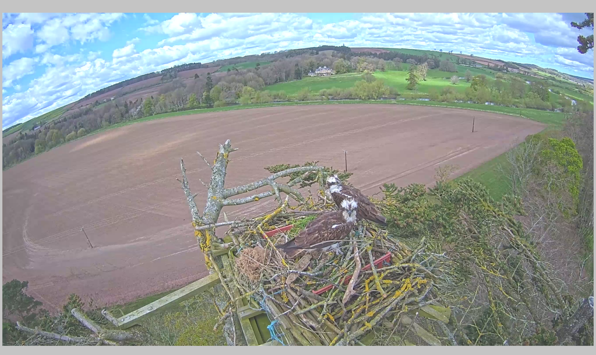
Looking comfortable with each other already

So things are looking promising. Kielder may have got rid of a problem and we may have acquired a new mate for Samson. Time will tell but things are certainly looking a lot more optimistic than 24 hours ago. I will keep you posted on developments.