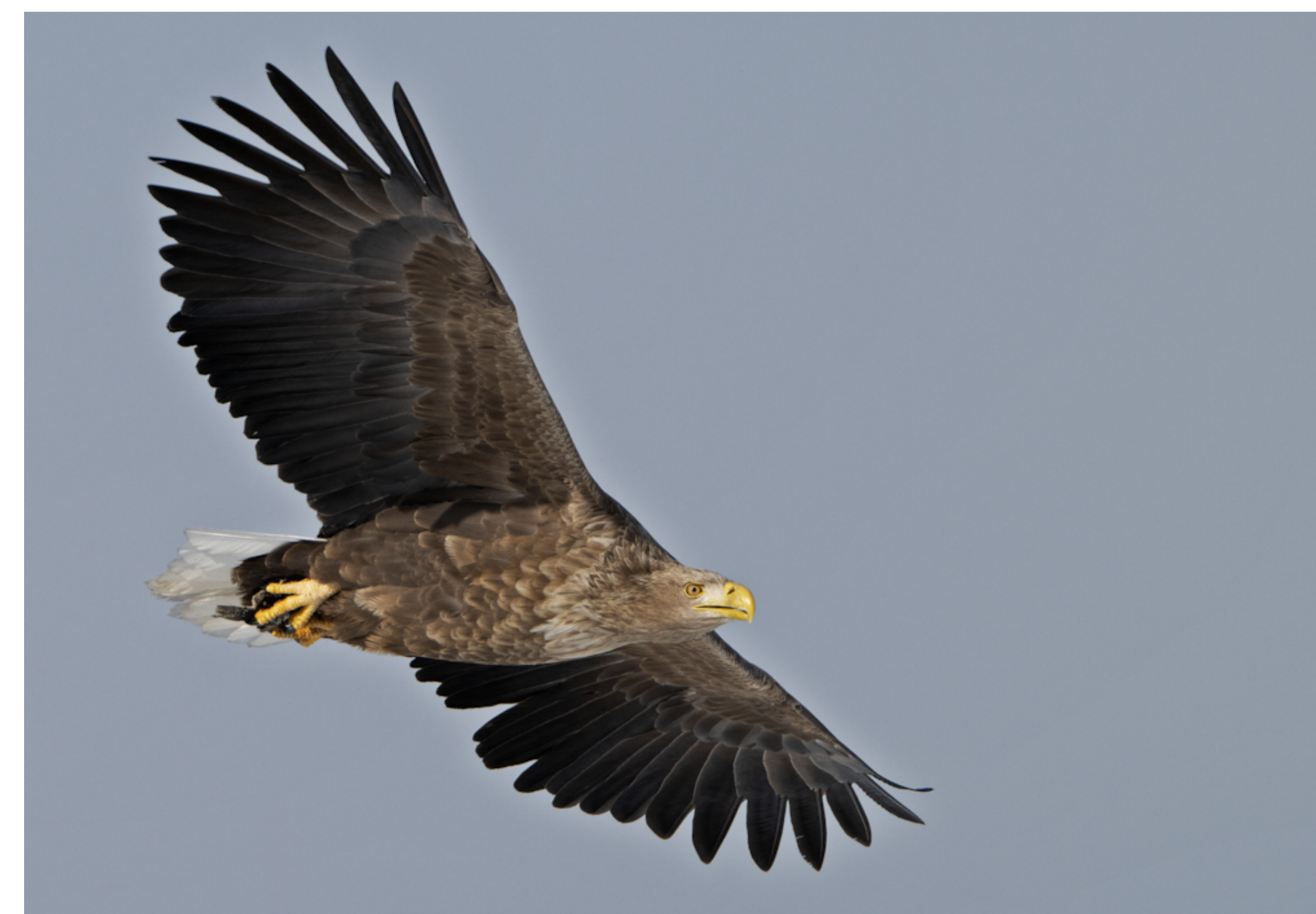
White-tailed Eagle has bred in Belgium for the first time in half a century (Clive Finlayson).

White-tailed Eagle was lost as a breeding bird in Belgium half a century ago, with a modern-day status of a scarce winter and passage visitor. However, following an increase in populations in neighbouring countries, especially the Netherlands, a pair nicknamed 'Paul' and 'Betty' set up shop at De Blankaart in 2023.