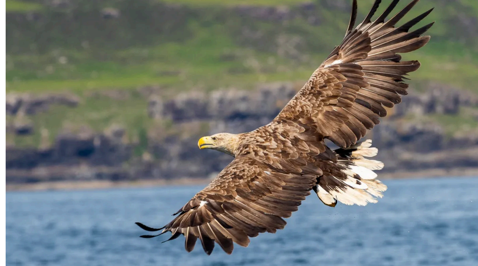
The Isle of Mull is a good place to spot white-tailed eagles

Learn more about Britain's birds with our guides to seabirds , wadlers and swans .