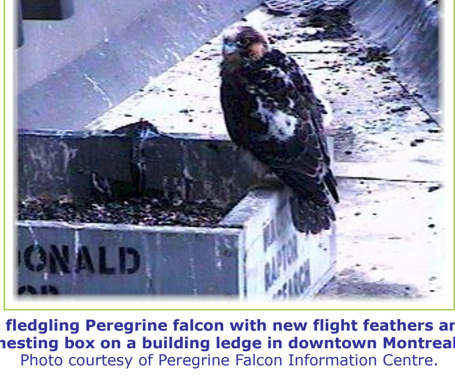
A fledgling Peregrine falcon with new flight feathers and nesting box on a building ledge in downtown Montreal.

Beginning a breeding and captive release program for Peregrine falcons was not likely to be a panacea and in no way guaranteed that the population could be reestablished in the wild. Even as large numbers were reintroduced to former habitats, it was not easy to prove that they were surviving and reproducing, the true measure of the project's success. However, in the early 1970s, two events occurred that almost certainly tipped the balance in favor of the Peregrines. First, the U.S. and Canada finally banned the use of DDT. Second, Congress passed the Endangered Species Act in 1973, placing the species under vast federal protection. Together these measures provided protections that the Peregrine falcon's wild brothers and sisters had not enjoyed during their decades of steep decline.