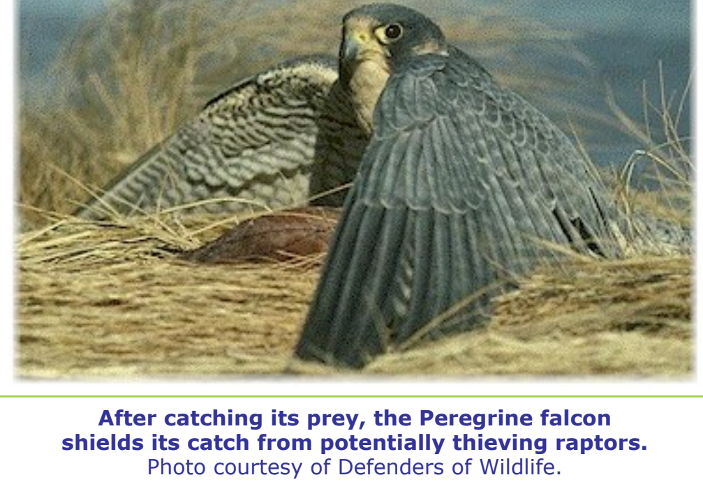
After catching its prey, the Peregrine falcon shields its catch from potentially thieving raptors. Photo courtesy of Defenders of Wildlife.

In April 1996, after the state decided to abandon efforts to establish breeding pairs of Peregrine falcons in Atlanta, biologists confirmed that a banded female was once again nesting on the 48 th floor ledge of the Marriott Marquis. Researchers speculated that it was probably the same pair that attempted to nest in a planter on the 52 nd floor of the nearby Peachtree Center building. The Peachtree Center pair was disturbed by building maintenance workers and abandoned the first site after a few days of enduring human activity.