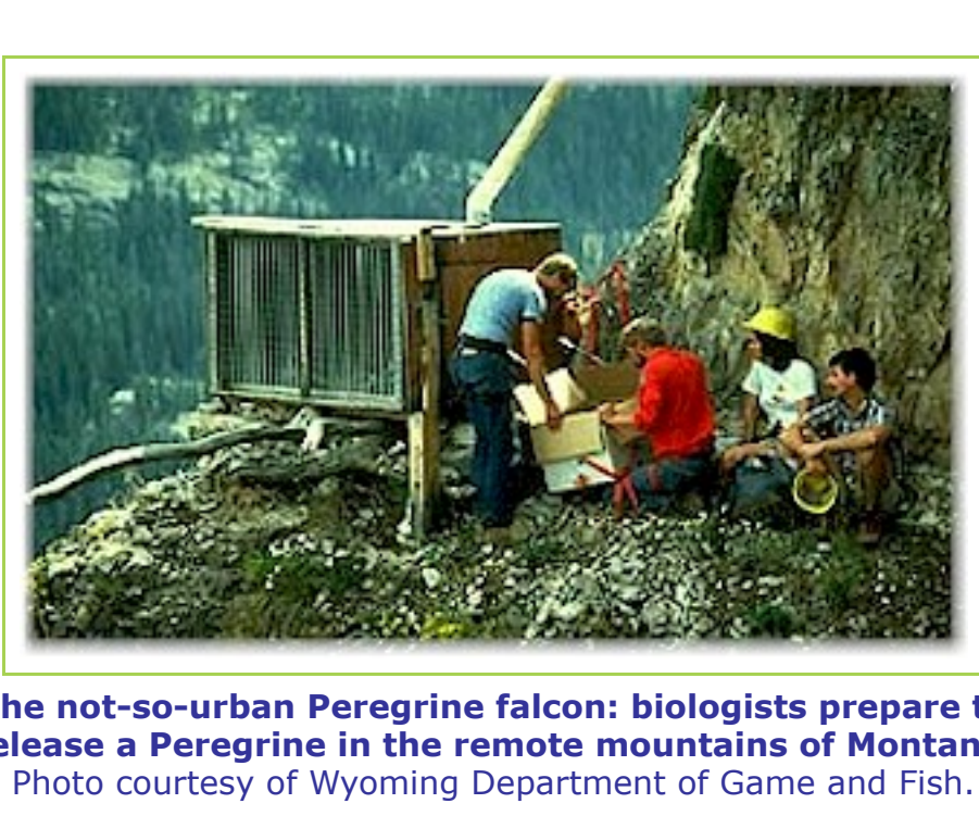
The not-so-urban Peregrine falcon: biologists prepare to release a Peregrine in the remote mountains of Montana.

One reason that Peregrine falcon aficionados believe the birds thrive in large cities is the abundance of prey in the form of typical small urban wildlife. Pigeons, starlings, and blue jays make for easy targets and there is not much competition from other predators. Peregrines have been known to prey on rats and ground squirrels for predatory variety. Also, skyscrapers in the cities that have attracted the falcons have ledges that approximate the cliffs the species uses in wilder settings. However, Peregrines shun building nests, often requiring some sort of box or other modification to prevent the eggs from simply rolling over the edge and the fledglings from falling to the ground.