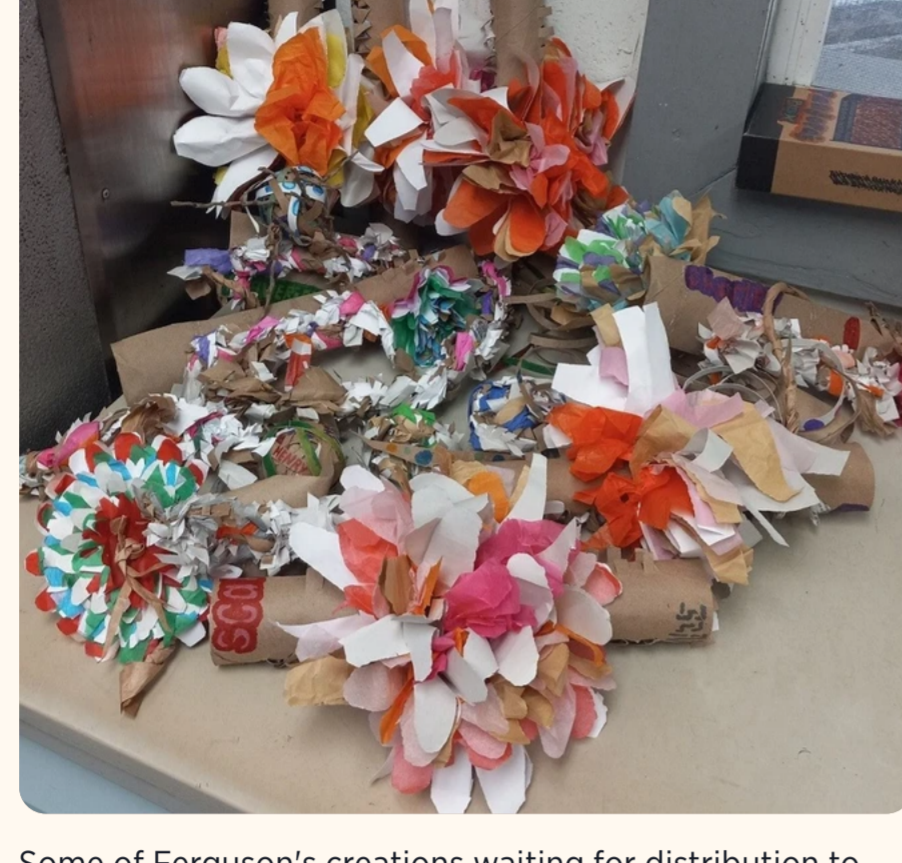
Some of Ferguson's creations waiting for distribution to the birds.

The Center for Birds of Prey has an entire volunteer team dedicated to assembling and distributing enrichment — anything from ping pong balls to tissue paper, sticks to paper towel rolls, that will keep the birds engaged and busy. There are strict USDA guidelines for enrichment, ensuring it's all safe for the birds and the environment, but volunteers are encouraged to get creative. Nobody does creativity better than Lisa Ferguson.