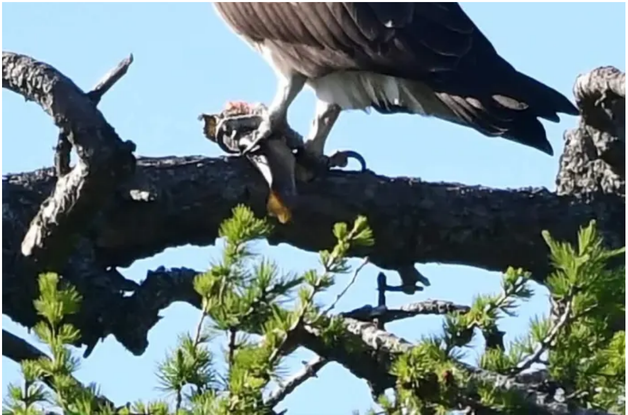
Samson sunbathing with a fish on a nearby tree to the nest

As broadband has finally reached the particular depths of this part of the Scottish Borders, I am excited to be able to tell you that we have set up a live feed so you can watch the day to day “goings-on” at Samson and Augusta’s nest. It’s very much at the experimental phase and you know how much fun and games we’ve already had this year with the non-osprey side of operations. However, if you will bear with us when the feed doesn’t work or the sun refuses to shine and the battery goes on strike, plus all the other glitches that might happen, you can enjoy as much as I do the truly awesome sight of our osprey family raising their 2026 famil