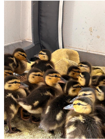
A group of baby Mallards inside our Richardson Waterfowl Centre, part of the 90 orphaned waterfowl currently in our care.

Caring for this many young birds is a full-day, seven-days-a-week job. From early morning until late evening, our team is cleaning enclosures, preparing food and moving birds into different spaces as they grow bigger. We are busy collecting duckweed and fresh grasses to help meet their needs.